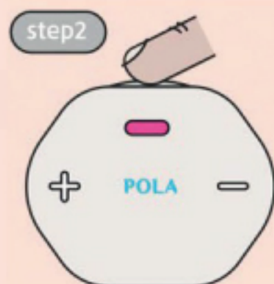
step2 Press mode button & change mode