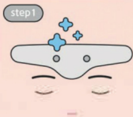
step1 Clean & side on your forehead