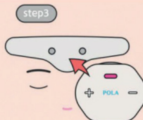
step3 Attach the device on your forehead