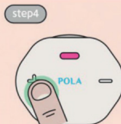
step4 Press (+,-) button to adjust the intensity